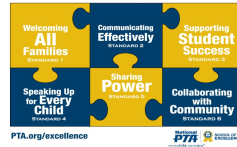
National Standards for Family-School Partnerships